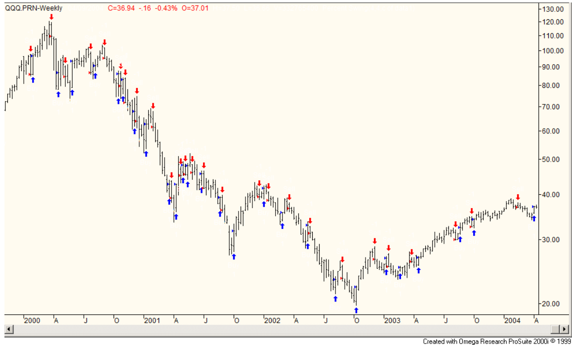
Figure 1 - 4% Swing System NASDAQ-100 Trust (QQQ) 1999-Apr 2004, Weekly Bars; Buys Indicated By Up Arrows Below Price Bars, Sells By Down Arrows Above Price Bars

based on weekly closes for the Value Line Composite index, the system buys after a four percent rise above a prior weekly low and sells after a four percent decline from a prior weekly high. The system can be followed on a chart without a computer. The system was profitable during a 19-year back-test period from 1966 to 1985, prior to its publication, and has remained profitable since its publication.